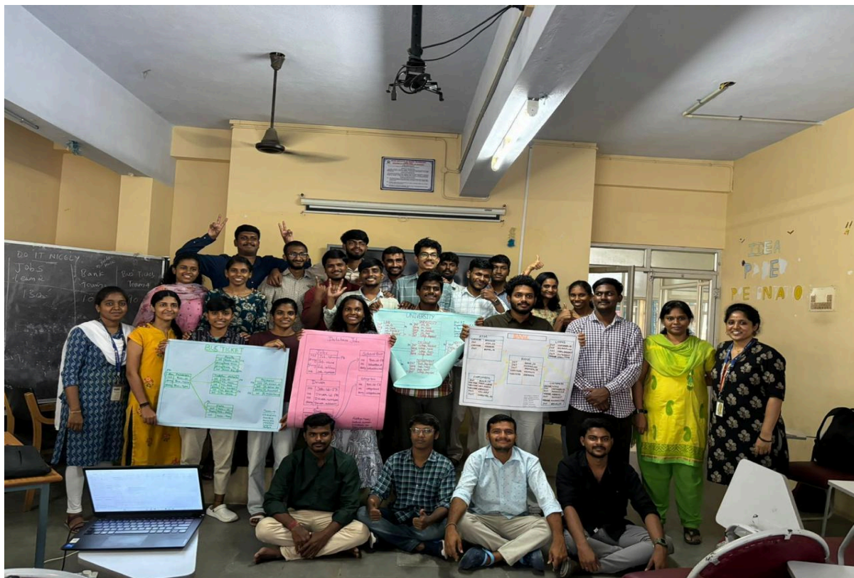
Figure:3 Awareness Campaign to promote water usage

Anand Nagar, Krishnankoil, Srivilliputtur (Via), Virudhunagar (Dt) - 626126, Tamil Nadu | info@kalasalingam.ac.in | www.kalasalingam.ac.in