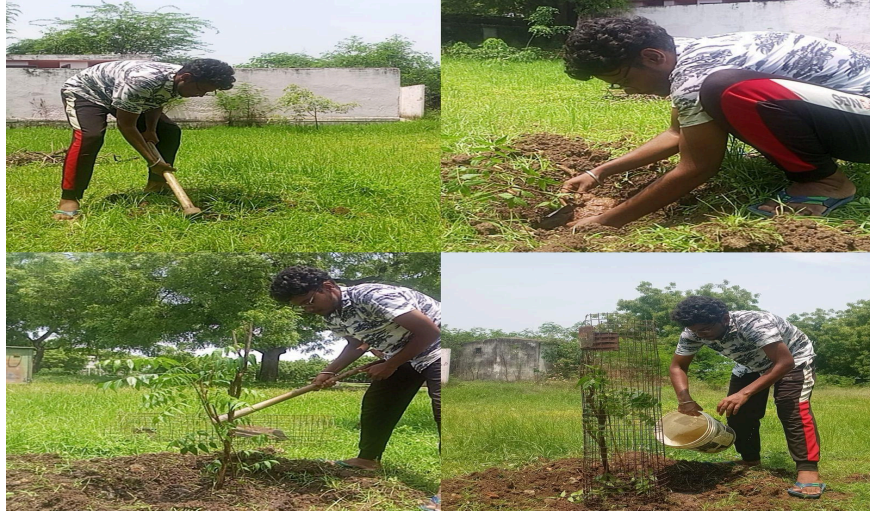
Figure:8 Tree Plantation awareness program in Kalaimagal School- Ramachandrapuram.

Anand Nagar, Krishnankoil, Srivilliputtur (Via), Virudhunagar (Dt) - 626126, Tamil Nadu | info@kalasalingam.ac.in | www.kalasalingam.ac.in