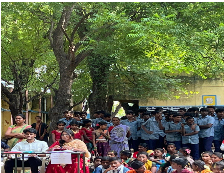
Figure:7 Awareness Programme

On the account of World water day, our NSS/NCC students organized a rally at Ramachandrapuram village. At this rally Placards focused on the importance and promoting conscious water usage in the wider community in Ramachandrapuram village. Also our Tamil Mandaram students planted trees in various villages and created awareness in school children.