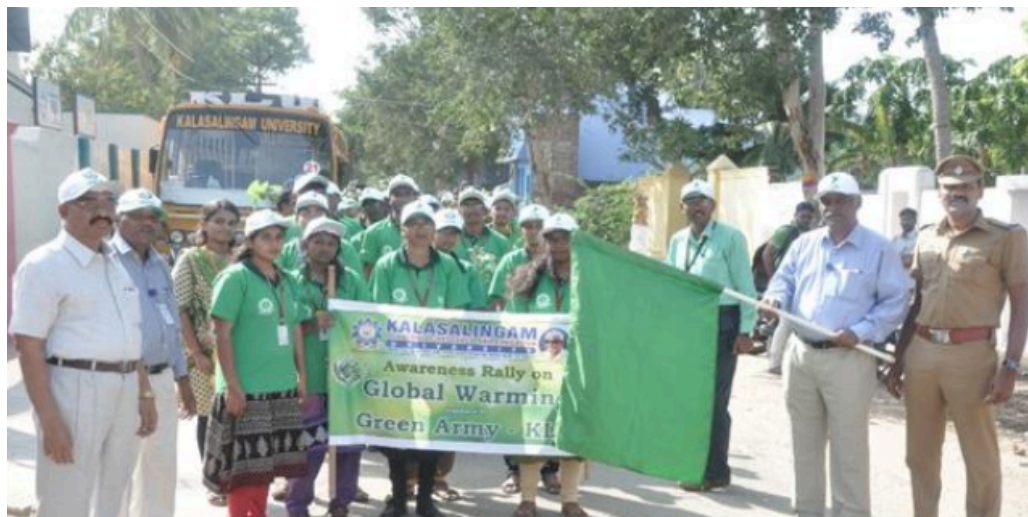
Figure:4 Global Warming Awareness Rally

Anand Nagar, Krishnankoil, Srivilliputtur (Via), Virudhunagar (Dt) - 626126, Tamil Nadu | info@kalasalingam.ac.in | www.kalasalingam.ac.in