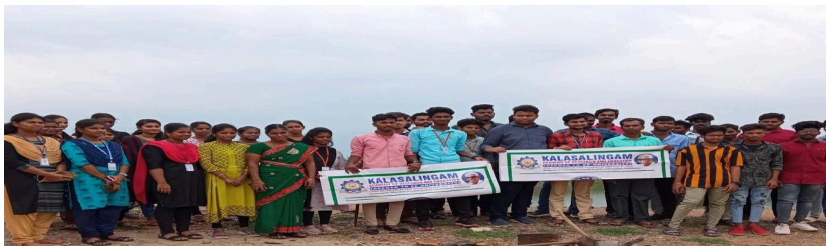
Figure:5 Awareness programme to identify water wasting habits through students self evaluation

Anand Nagar, Krishnankoil, Srivilliputtur (Via), Virudhunagar (Dt) - 626126, Tamil Nadu | info@kalasalingam.ac.in | www.kalasalingam.ac.in