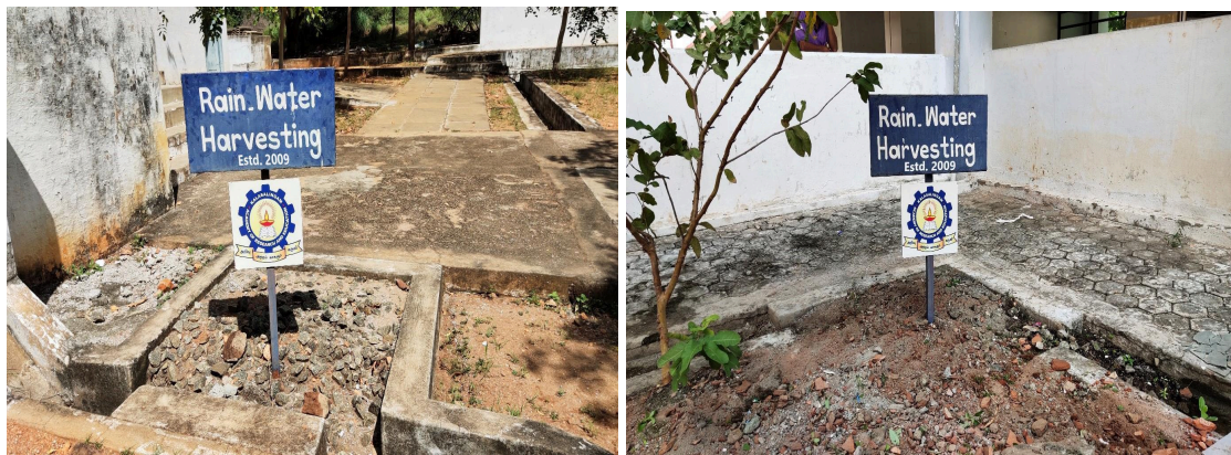
Figure:2 Rainwater Harvesting System

The institution has a huge area for water absorption during the rainfall. The rainwater is also stored in the check dam and percolation pond. Due to this facility the groundwater level within the campus has increased. Rainwater harvesting facility is also provided in each building so as to harvest the rainwater and store them for a long period.