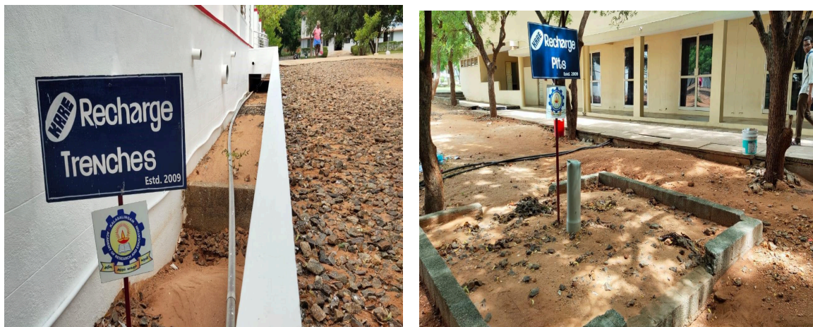
Figure:3 Recharge Trenches