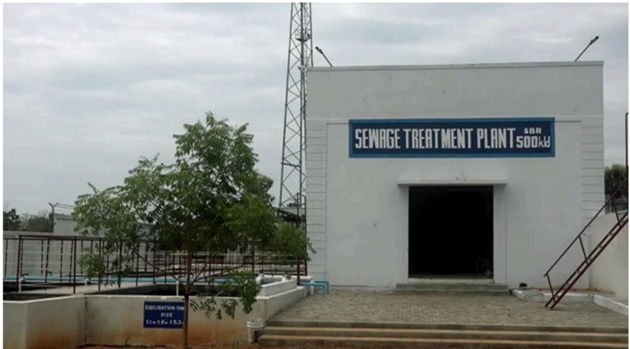
Figure:5 Sewage Treatment Plant inside the KARE Campus (500 Kiloliter per day)