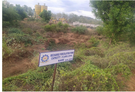
Figure:4 Recharging Percolation Ponds