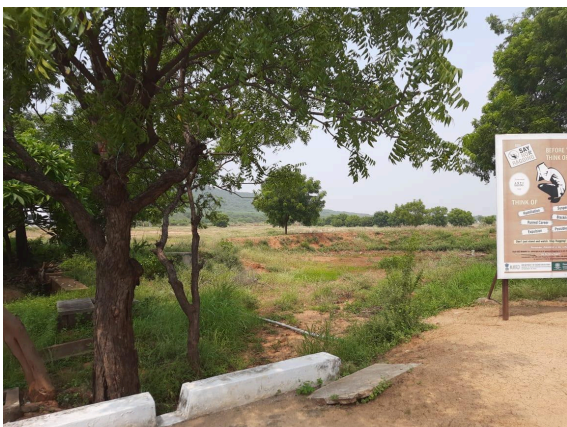
Figure:1 Location of Dam for water absorption and storage within the KARE campus