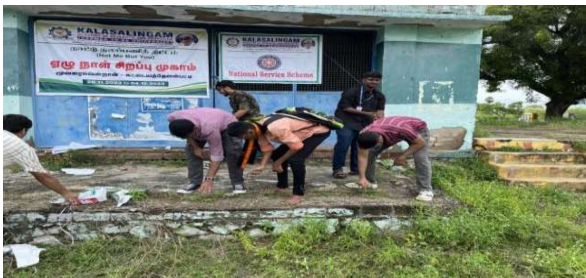
Unnat Bharath Abhiyan (Clean India Campaign) About 500 students participated in the camp were organized on 28.11.2023 to 04.12.2023