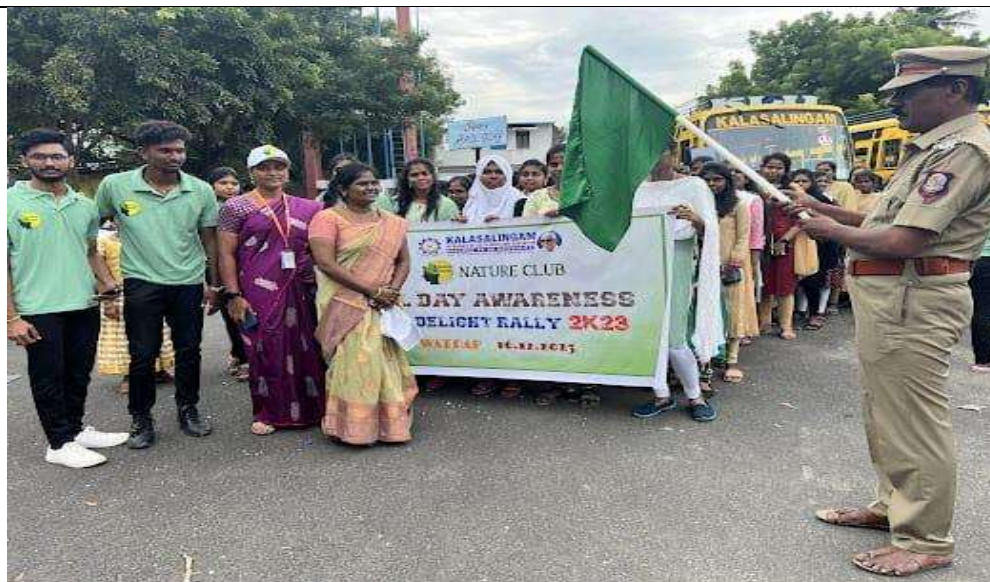
Our Nature Club took a moment to celebrate the same on 16th December 2023. An awareness rally was conducted by Nature Club, KARE at Watrap- Nature Club on 16.12.2023