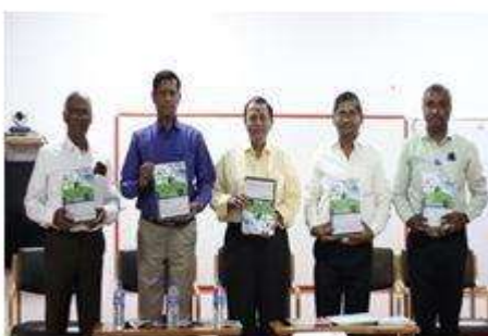
Book release and distribution