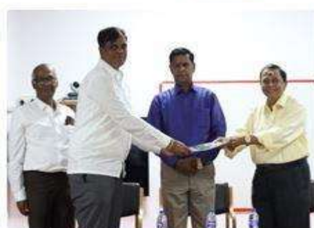
Receiving book copy by CEO Saithanya group of institutions Madurai