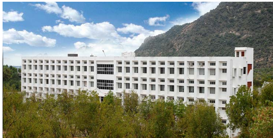
Information Technology Block