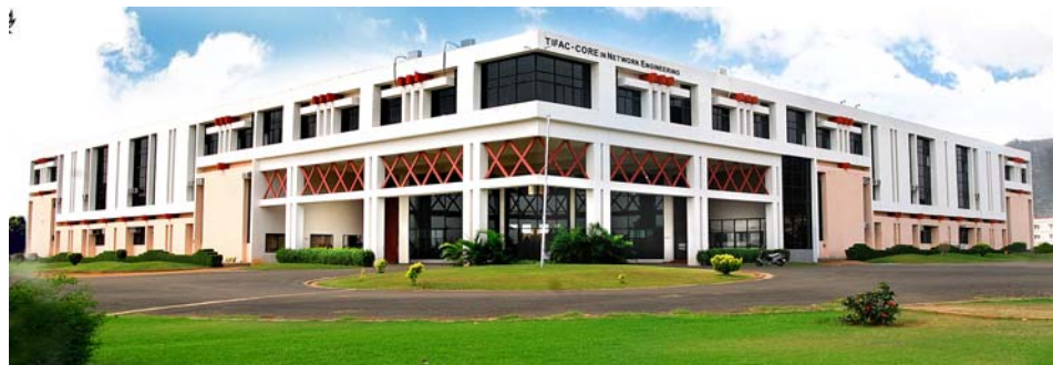
TIFAC CORE in Network Engineering