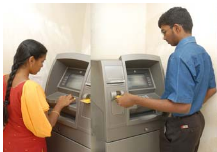
Bank with ATM

Bank, Post Office, Estate maintenance, Courier service, NCC office and Beauty clinic/saloon are housed in a single complex. All the buildings are provided with intercom facilities. Internet and intranet facilities are also available in all the buildings.