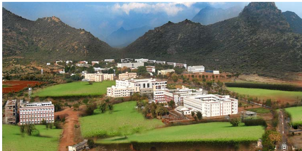
Aerial view of the Kalasalingam University Campus

The University situated in sprawling campus of 245 acres, at the foot hills of Western Ghats in a green and scenic environment with a constructed area of 15,75,000 square feet, provides comfortable and inspiring environment for the students with all necessary amenities. Class rooms are furnished with adequate seating arrangements and are equipped with modern ICT facilities, including SMART boards, audio-visual teaching aids, computers and LCD projectors. The University has adequate physical infrastructure for conducting all the academic and supporting activities as per UGC/AICTE norms.